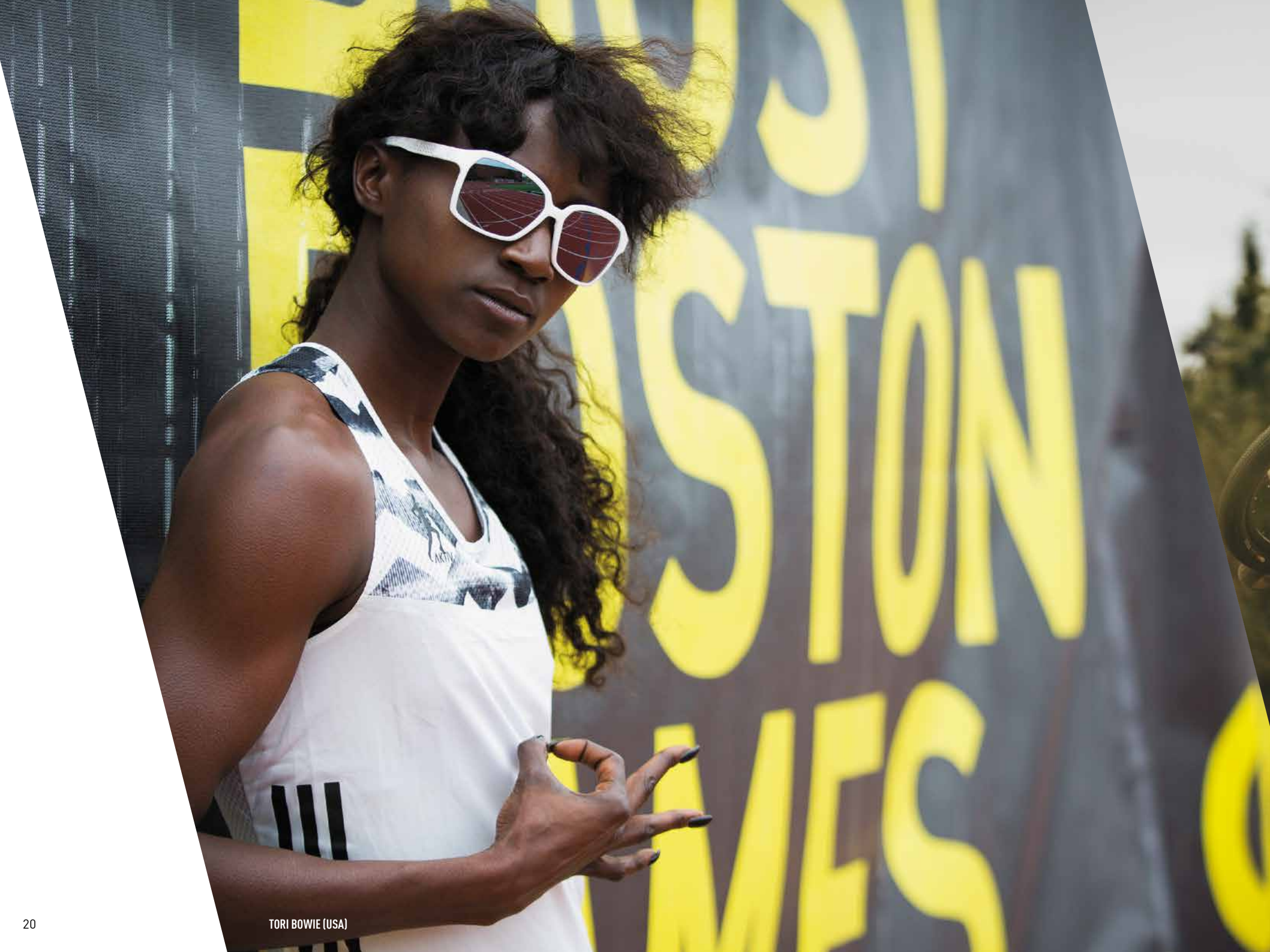
TORI BOWIE (USA)