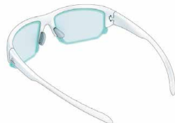
adidas direct freeform glazing