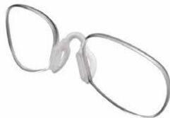
a779 Performance Insert: